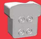
45 Degree Adaptor