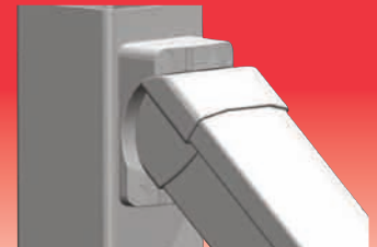
Adjustable Stair Bracket