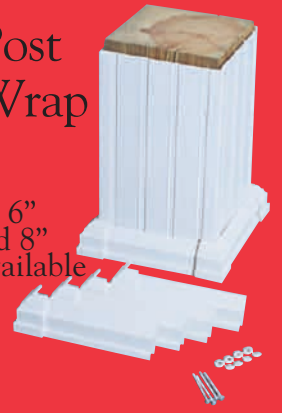
4", 6" and 8" Available