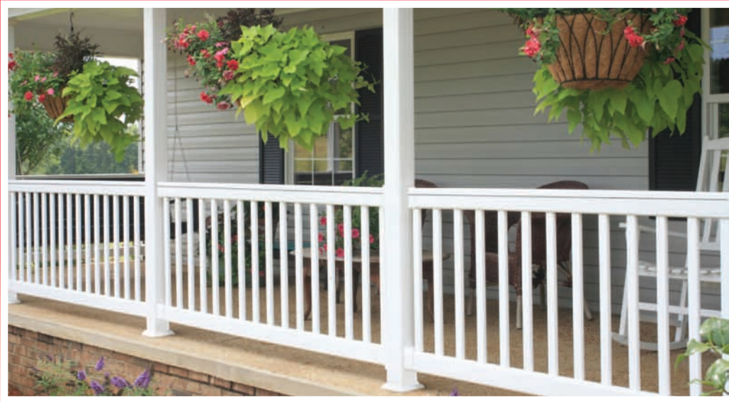
Flat Rail Available in 6', 8' & 10' Widths Stair Rail Available in 6' & 8' Widths